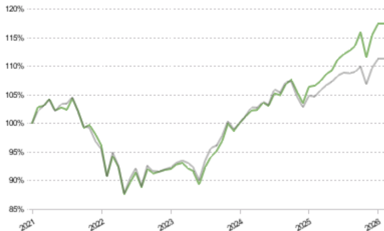
FCT 1e 45 Global Pictet LPP 2005 40 Plus TR CHF