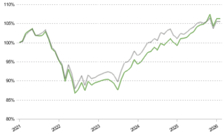
FCT 1e 25 Sustainable Pictet LPP 2005 25 Plus TR CHF